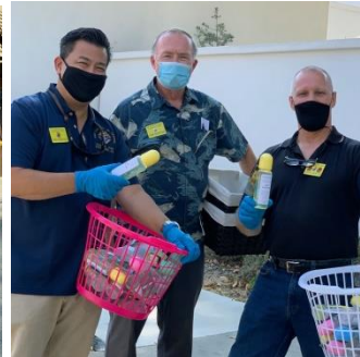
Council participates in 2 Culture of Life events prayers at abortion clinic, baby bottle drive.