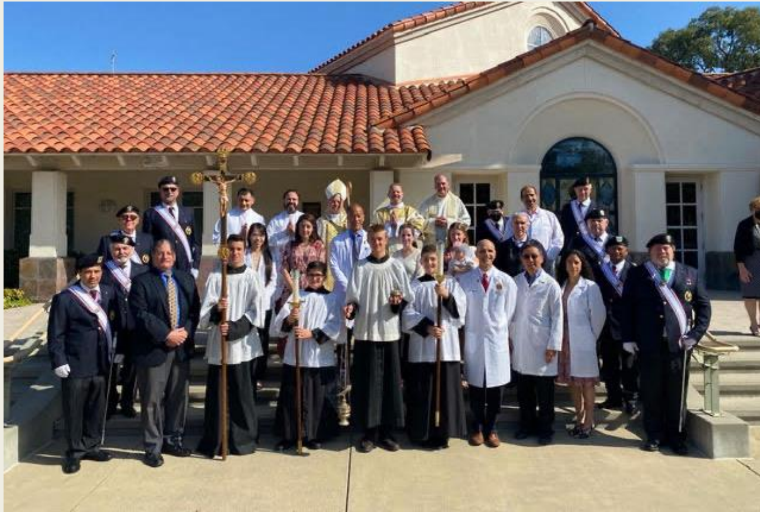
Peyri Assembly Color Corps with Bishop Ramon plus Health Care Workers during White Mass 11/30/2021 at Elizabeth Seton Catholic Church