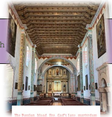
The Passion blood, Ours, God's Love, martyrdom

The Official Newsletter of the Mission San Luis Rey Parish Knights of Columbus Council #3162