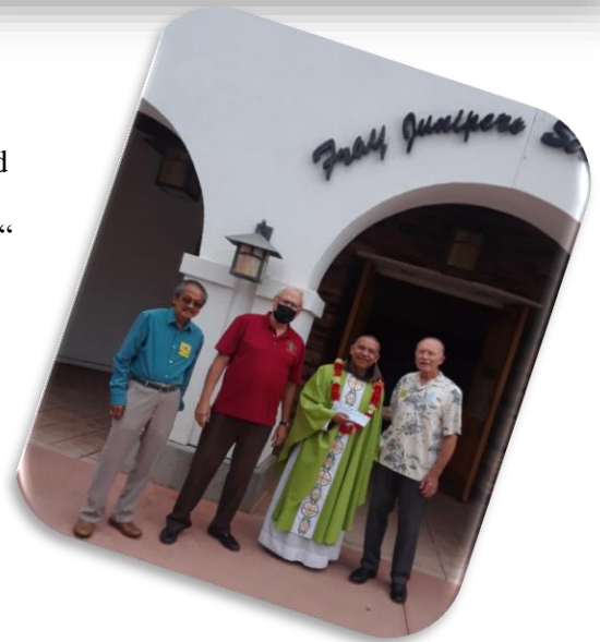
Feast San Luis Rey de Francia