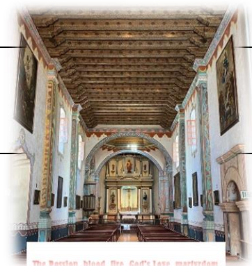
The Boston blood. Dr. God's Last martyrdom

The Official Newsletter of the Mission San Luis Rey Parish Knights of Columbus Council #3162