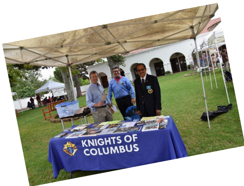
09-17-2023 Ministry Fair