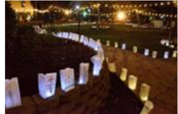
Luminaries from Squire Rose

Tis the Season, Keep Christ in Christmas, Daily news updates and opinions