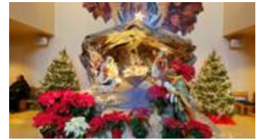
Nativity Scene Mission San Luis Rey