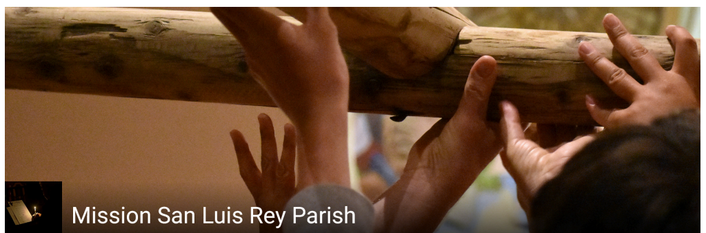
Mission San Luis Rey Parish